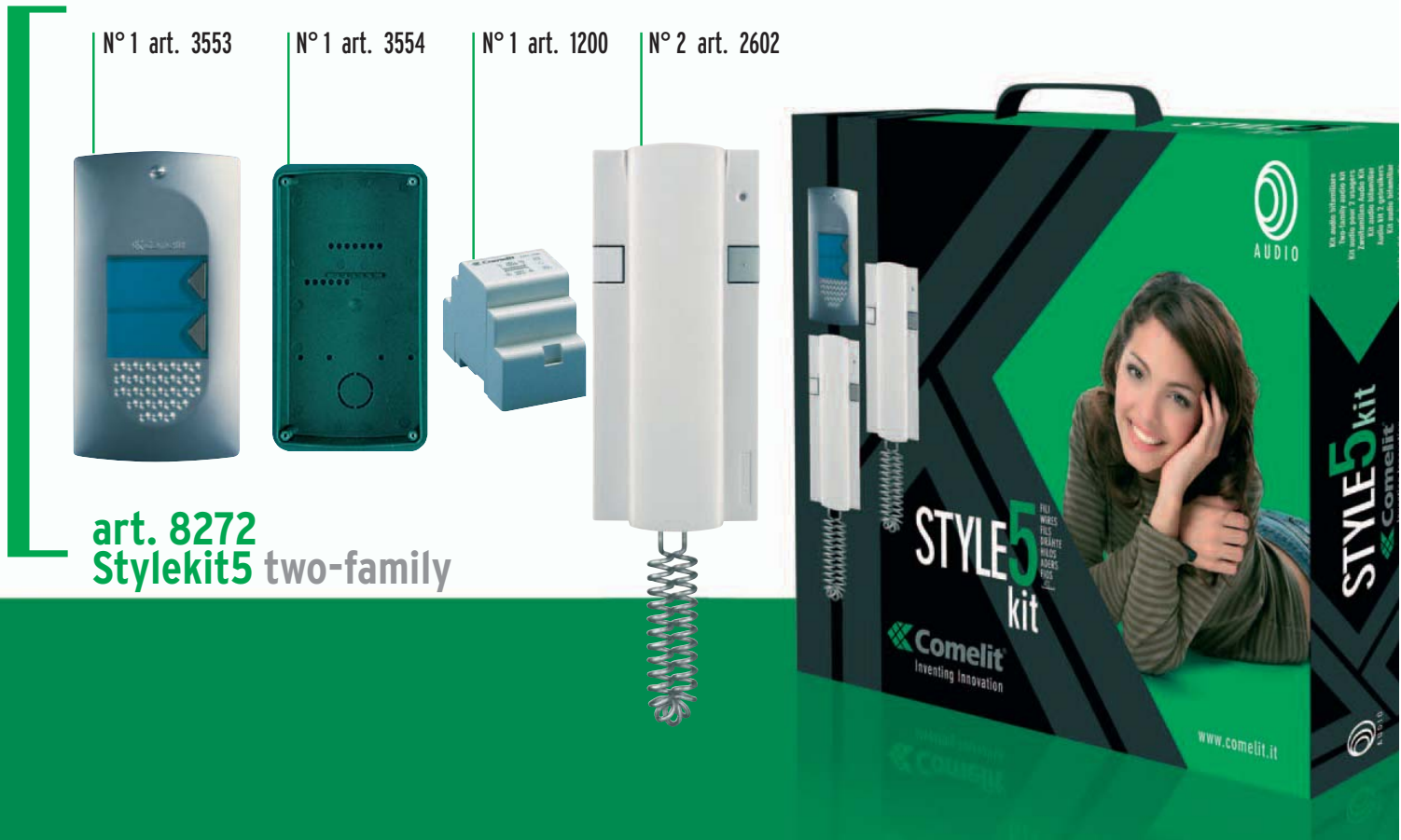
art. 8272 Stylekit5 two-family